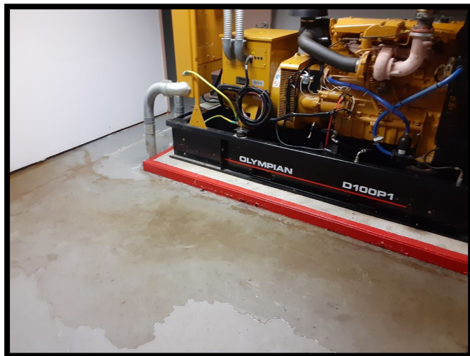
Flooded LEDU Basement shop vacuumed during each rainstorm. Water flows directly towards an emergency generator.

This project will design, and correct health life safety issues related to poor drainage and overall water issues throughout the NHVH Site in Tilton. Currently, significant amounts of water seeps into the LEDU basement electrical room and is frequently mopped up by staff or await evaporation.