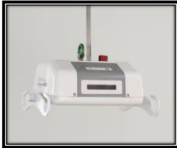
Typical 650 LB Bariatric Lift. It is the Long term plan to outfit, incrementally, the entire building.

This project will begin to outfit the building with ceiling lift systems to accommodate our growing bariatric population at the NH Veterans Home in Tilton NH. To phase-in requirement, this installation will consist of Phase 2, 11 lifts. This project is consistent with the strategic priority to admit more in need veterans and grow the census.