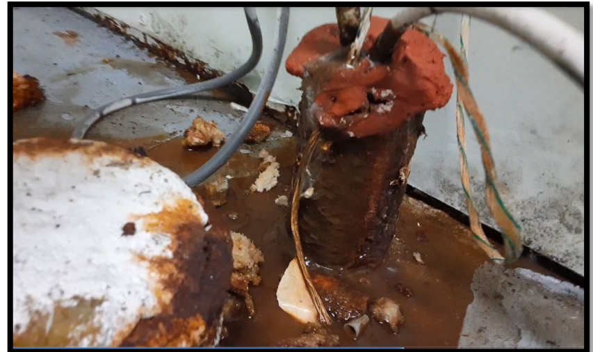
Water spews out of data port conduit during rainstorm April 2022