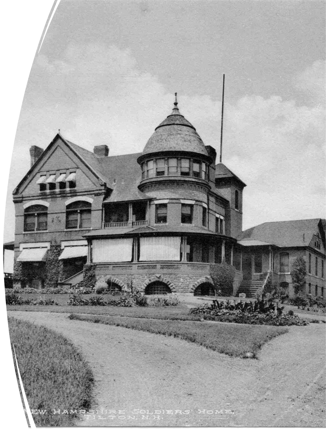
NEW HAMPSHIRE SOLDIERS' HOME, TILTON, N.H.

In 1889, to take advantage of the federal assistance, Governor David H. Goodell established a veterans' Board of Managers, made up of prominent citizens, to select a site for a Soldiers' Home for Civil War veterans unable to care for themselves by reason of wounds, old age, or other infirmities. They chose Tilton NH as their location and The New Hampshire Soldiers' Home was dedicated during ceremonies on December 3, 1890.